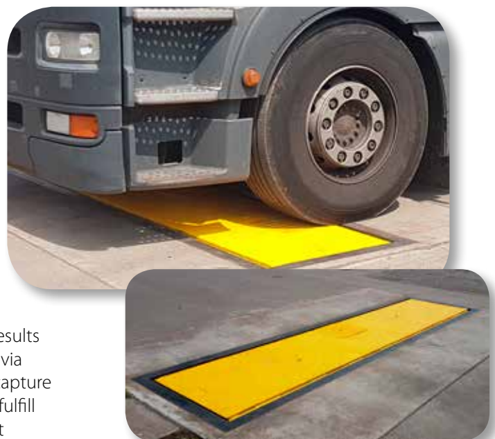
Fixed axle weigher

The axle weighing solution produces highly accurate results at speeds up to 5 km/h. Weight data can be transferred via USB device from the ZM510 indicator to a PC for data capture and analysis. The system also provides data outputs to fulfill the requirements of most fleet management and client operating systems.