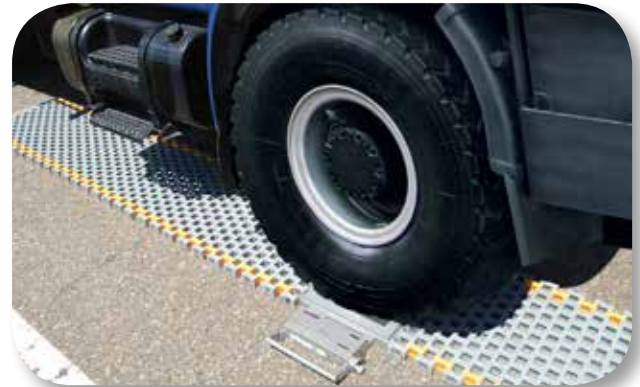
LS630 portable in-motion axle weighing system

When weighing long multi-axle vehicles, correct wheel positioning on static scales can prove difficult and time consuming. In-motion or dynamic weighing provides a fast and accurate portable weighing facility for vehicles of all sizes, weights and axle configurations.