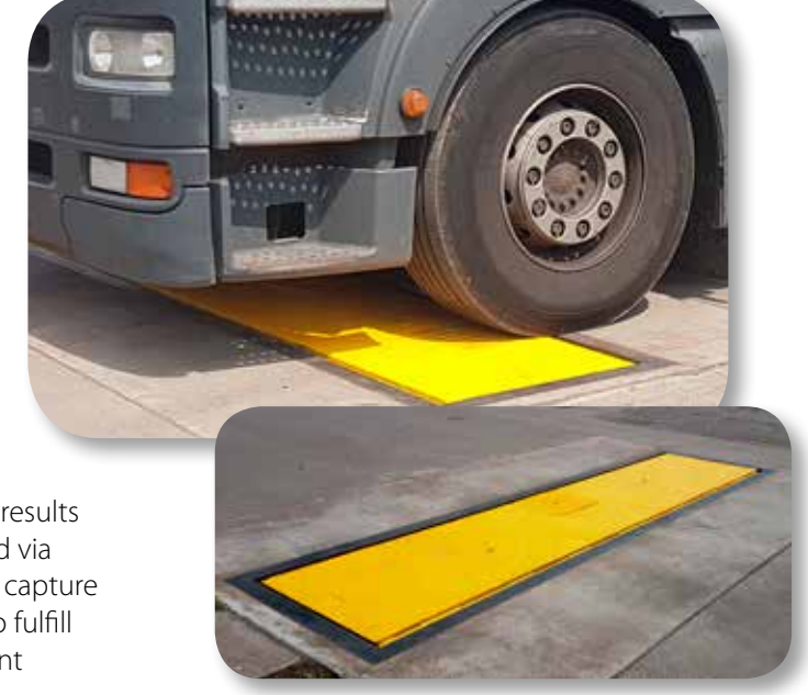
Fixed axle weigher

The axle weighing solution produces highly accurate results at speeds up to 5 km/h. Weight data can be transfered via USB device from the ZM510 indicator to a PC for data capture and analysis. The system also provides data outputs to fulfill the requirements of most fleet management and client operating systems.