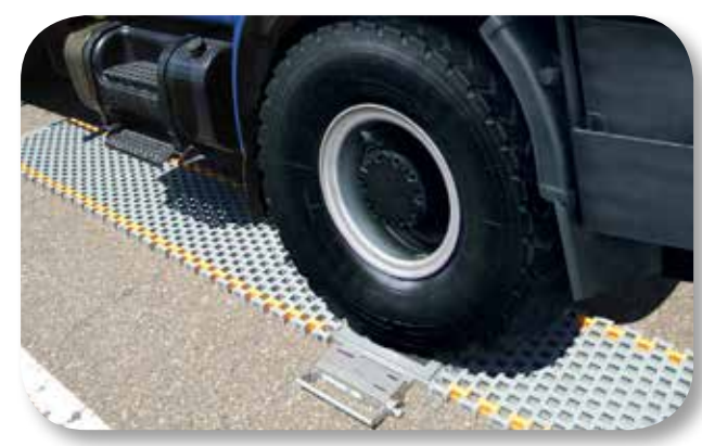
LS630 portable in-motion axle weighing system

When weighing long multi-axle vehicles, correct wheel positioning on static scales can prove difficult and time consuming. In-motion or dynamic weighing provides a fast and accurate portable weighing facility for vehicles of all sizes, weights and axle configurations.