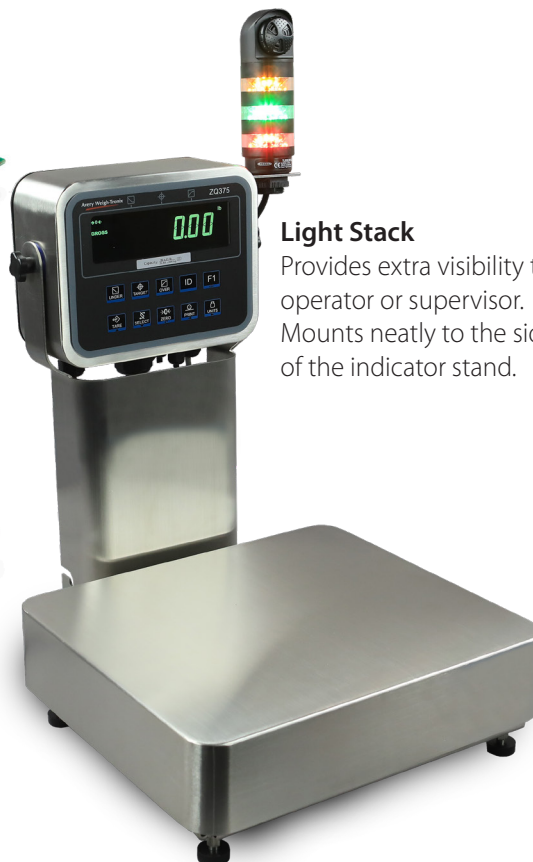
Light Stack Provides extra visibility to operator or supervisor. Mounts neatly to the side of the indicator stand.