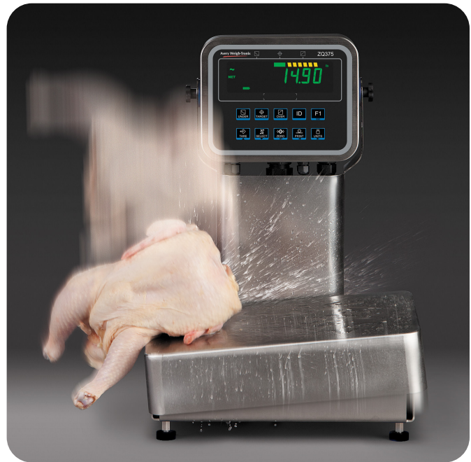
Torsion base features 500% shock loading protection

Able to withstand up to 500% shock loading, our breakaway load transfer system helps to guarantee accuracy and reliability at all times. This specialized base automatically transfers shock loads and overloads away from the load cell back to the base frame, ensuring that the scale's accuracy and performance is not affected. Unlike other designs used to reduce shock loading, this food grade stainless steel design offers a clean and uncomplicated solution that is fully NSF certified and washdown resistant.