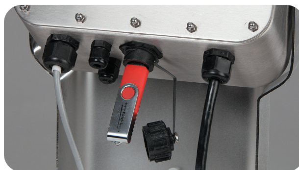
USB with optional waterproof gland