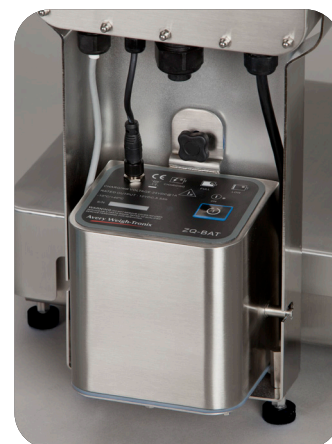
IP69K External Battery Pack Mounts neatly inside column. Toggle on/off. Rechargeable. Provides 16 hours operation.