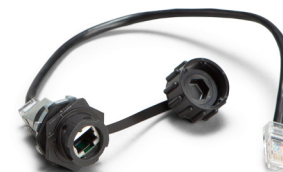
Watertight Gland Ethernet or USB