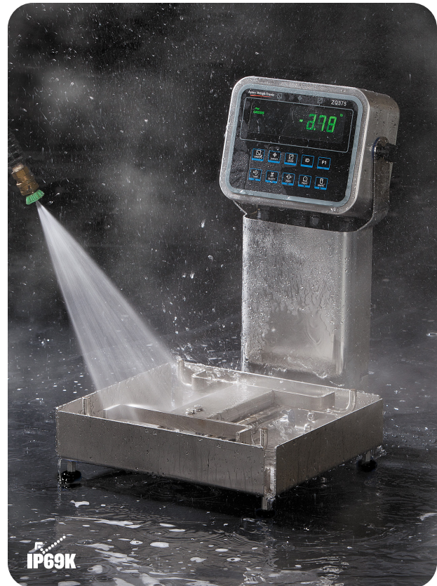
Easy to remove base cover for thorough cleaning

We recognize that good hygiene is vital to business success in the food industry. In line with USDA and other sanitation and hygiene standards, this NSF certified piece of equipment guarantees hygiene safety at all times. The ZQ375 has been designed for ease of cleaning. A smooth pickled and polished surface finish helps to stop microorganisms from growing on the surface of the scale. Curved corners and the easy-to-remove cover make thorough cleaning simple, fast and effective, minimizing food trap areas where bacteria could thrive. All threads are hygienically covered with domed nuts to aid and speed up cleaning processes.