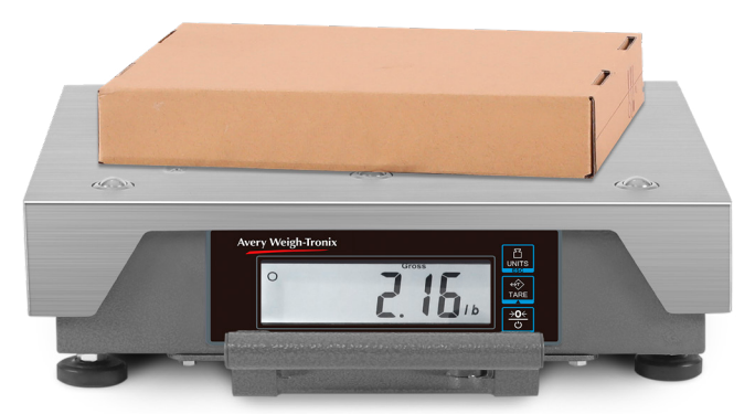
Model ZP212 Portable

Battery operated with a convenient handle for effortless mobility. Note: COM ports are not available on this model.