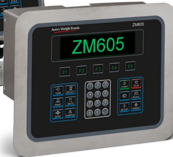
IP66 Stainless Steel Panel Mount Enclosure Graphic Display