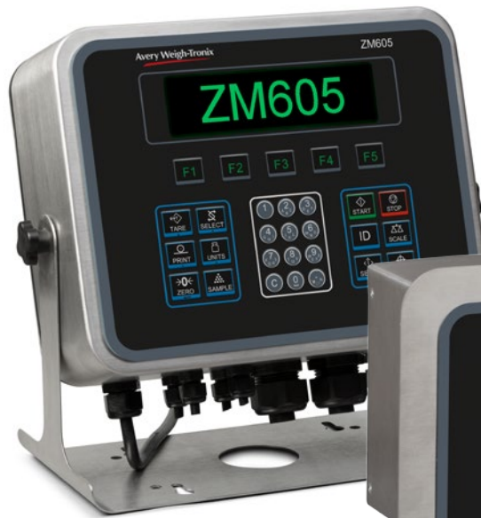
IP69K Stainless Steel Enclosure Graphic Display IP69K