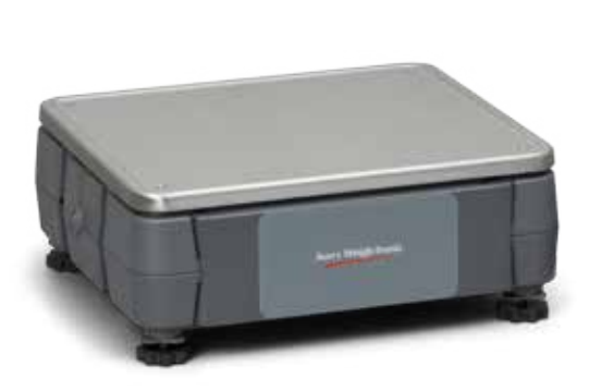
Large scale base 12 in x 14 in (305 mm x 355 mm) 70 lb &175 lb (35kq & 80kq)

The Quartzell's digital signal allows the scale to weigh faster and with greater resolution than standard load cells. Small and large items can be weighed on a single base, allowing one scale to do a job that might previously have required several. With a fast return to zero between readings, the BSQ provides the speed and repetitive accuracy that can be vital in situations where highly accurate weight readings are required.