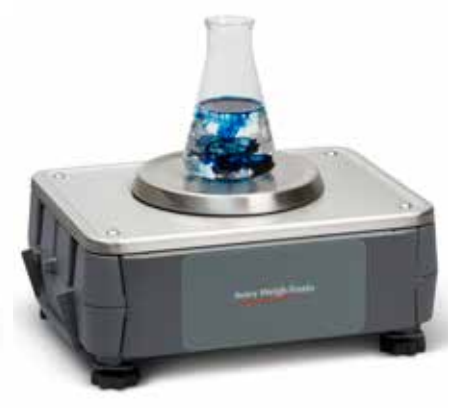
Small scale base 6" dia (152mm dia) 2 lb & 10 lb (1kg & 5kg) only