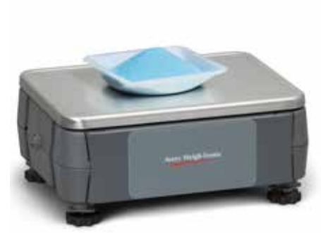
Medium scale base 9 in x 12 in (230 mm x 305 mm) 70 lb (35kg) only