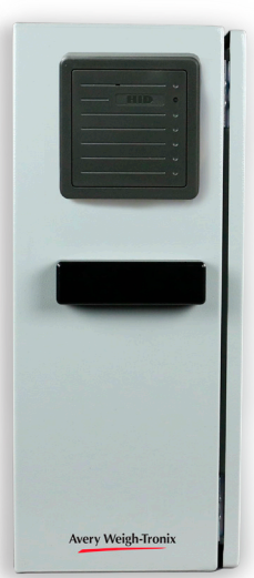
Kiosk Ethernet printer with RFID