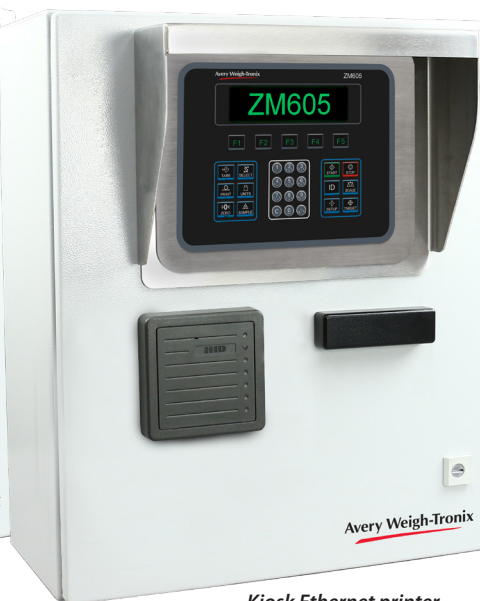
Kiosk Ethernet printer with RFID