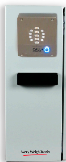
Kiosk Ethernet printer with intercom