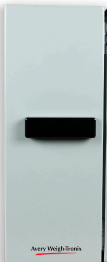
Kiosk Ethernet printer