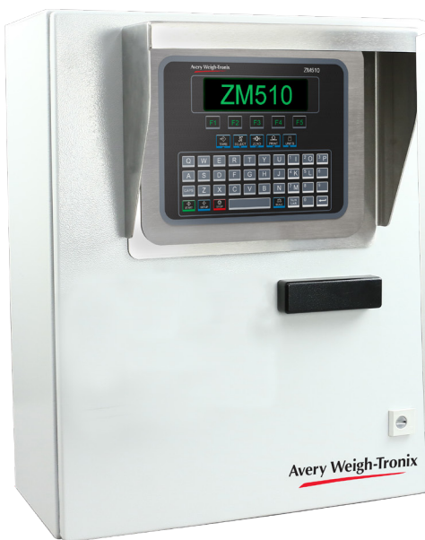
Kiosk Ethernet printer