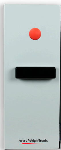
Kiosk Ethernet printer with pushbutton print