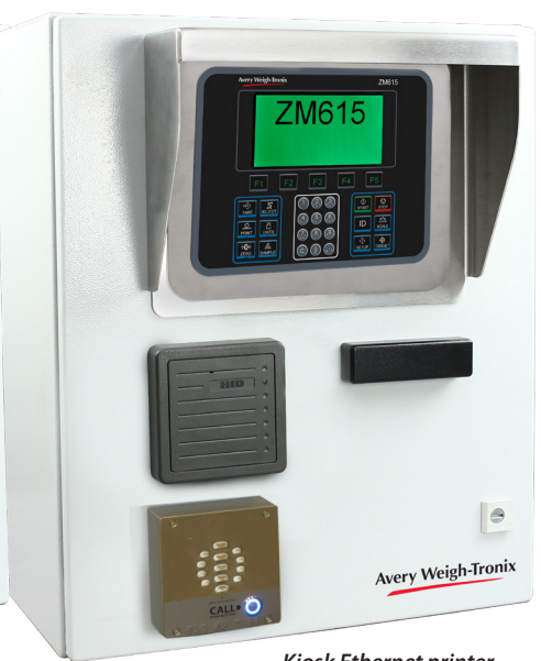
Kiosk Ethernet printer with RFID and intercom