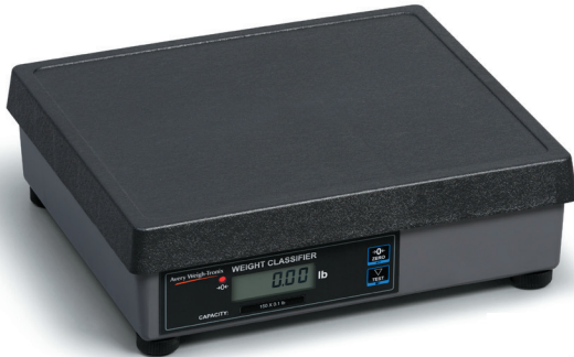
Model 7815 shown with six-digit LCD internal display