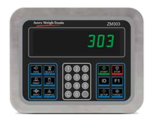
ZM303 keypad - 24 keys