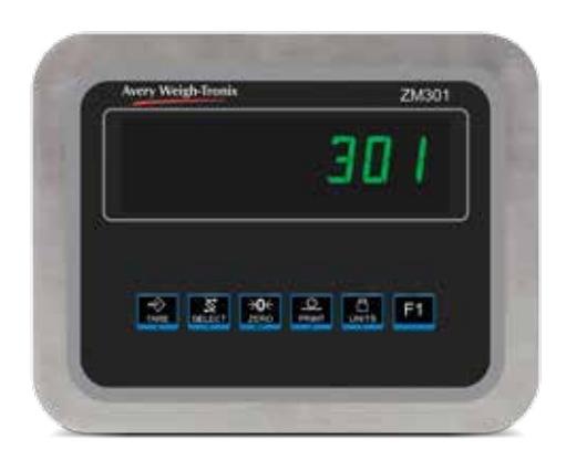
ZM301 keypad - 6 keys