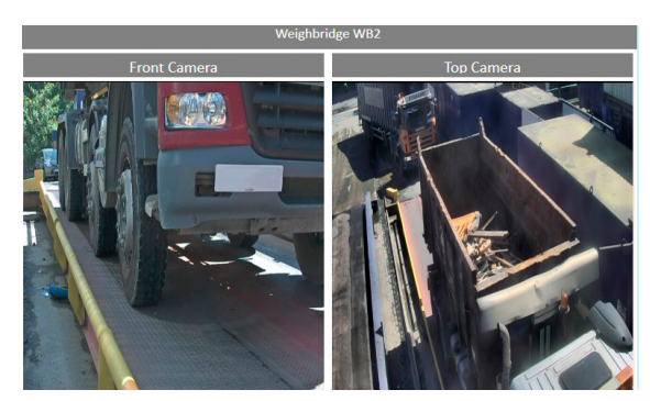
Enhanced vehicle image and video capture showing overhead view and wheel positoining