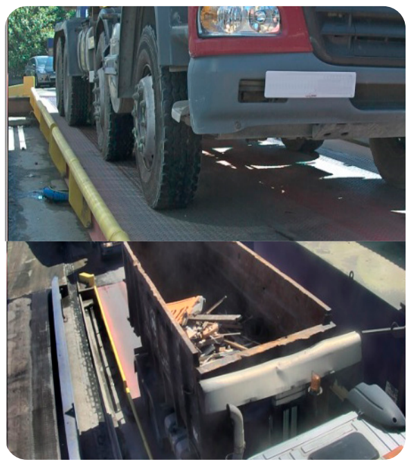
Vehicle positioning and overhead cameras capture images to be stored in Weighman8

Enhanced mode: Monitor activity on four weighbridges, each with up to two fixed cameras with live streaming.