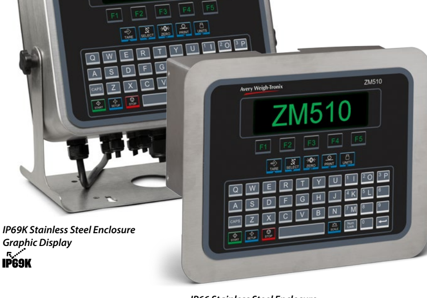
IP66 Stainless Steel Enclosure Graphic Display