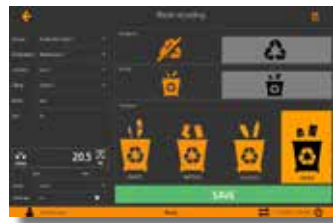
TraceWaste weight recording