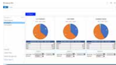
TraceWaste weight dashboard

Waste disposal is only part of the cost of waste generation; other hidden costs, such as the purchase price of the wasted materials, often get overlooked when estimating material losses. Minimising waste can help protect against unnecessary losses.