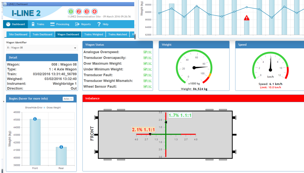
I-LINE2 Wagon Dashboard: Detailed imbalance errors highlighted