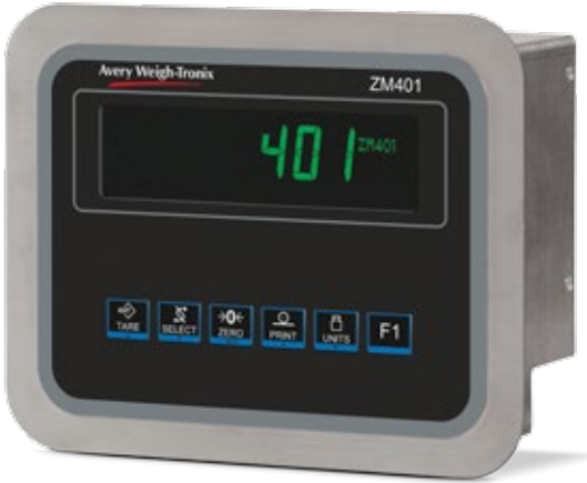
ZM401 Panel Mount