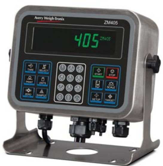
ZM405 Stainless Steel IP69K

The addition of a more comprehensive 24 key alphanumeric keypad allows ZM405 users to store multiple tares and alpha numeric IDs in the internal memory for easy retrieval and for simple entry of values. Both models also support the addition of a USB keyboard.