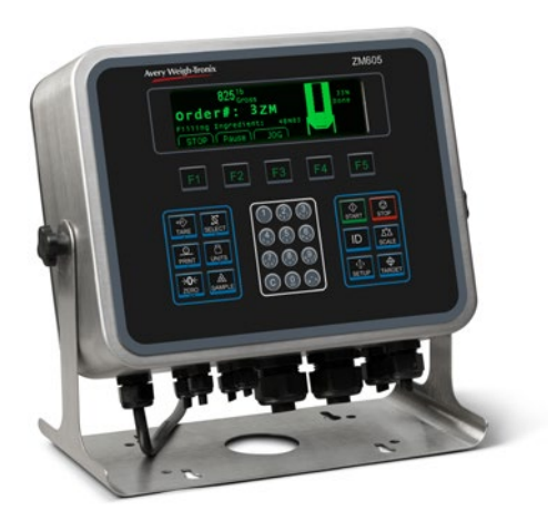
ZM605 – Pixels across the full length and height of the 320 x 80 display can be used to create personalized Human Machine Interface (HMI) messages such as user prompts, images and status annunciators.

ZM510 – A dot matrix 320 x 80 display can be used to create personalized messages such as user prompts, images and status annunciators. (Inverted display colors shown). A large QWERTY keypad offers input flexibility where adding an external keyboard would be difficult, such as panel-mount applications.