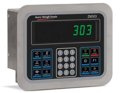
Stainless Panel Mount Enclosure