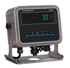
Stainless Steel Enclosure IBN Display