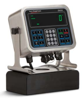
External Battery Pack

Attachable external battery pack with toggle on/off. Uses four D batteries providing 12 hours operation on a single weight sensor system and 11 hours on a four weight sensor system.