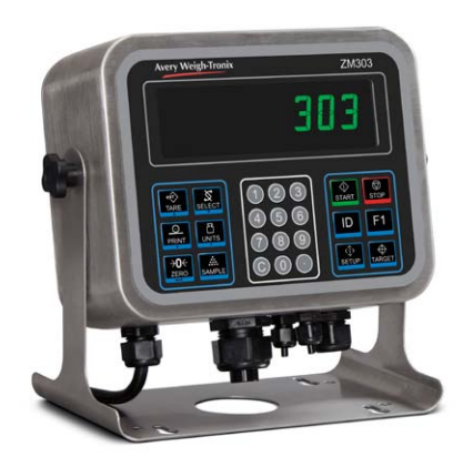
Stainless Steel Enclosure IP69K