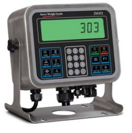
Stainless Steel Enclosure TN Display