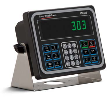
Tabletop Stand Kit

Attachable external battery pack with toggle on/off. Uses four D batteries providing 12 hours operation on a single weight sensor system and 11 hours on a four weight sensor system.