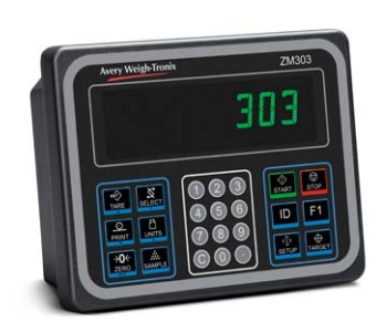
Tabletop Aluminium Enclosure

In addition to quick, easy and functional models suitable for use in all environments, the 304 brushed stainless steel models also include a swivel stand for adjustable viewing angles and provision for mounting onto a wall, desk, or column.