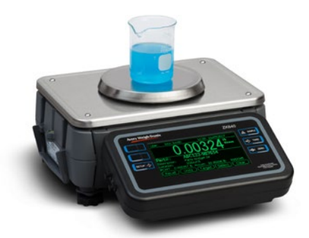
10 lb (5 kg) and 2 lb (1 kg) Models 6 in (150 mm) round platter