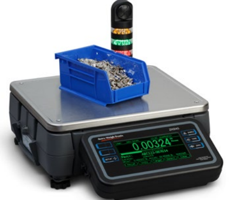
175 lb (80 kg) and 70 lb (35kg) models 12 in x 14 in (305 mm x 355 mm) platter

A robust die-cast clamshell enclosure provides protection for the Quartzell transducer. 1100% overload protection and a spring breakaway mechanism protect the cell from shock and dropped loads, ensuring accuracy and repeatability in even the most extreme conditions.