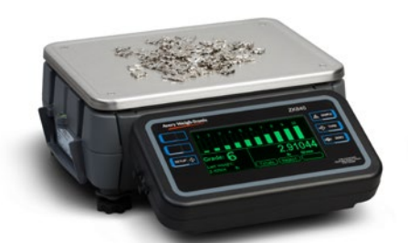
70 lb (35 kg) model 9 in x 12 in (230 mm x 305 mm) platter