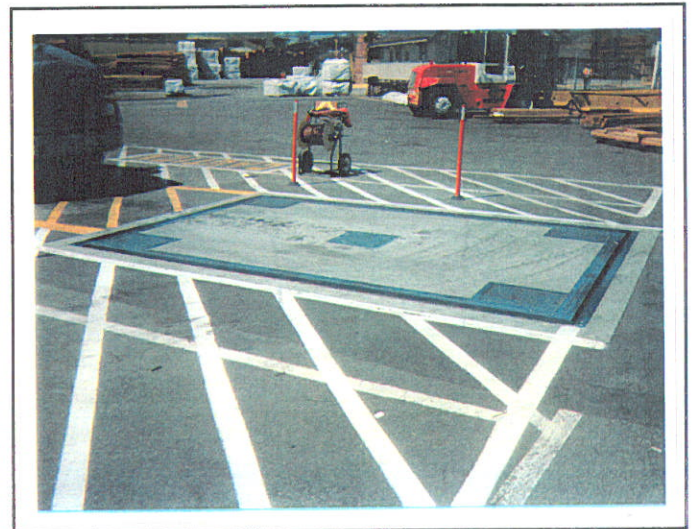
CONCRETE DECK MODEL